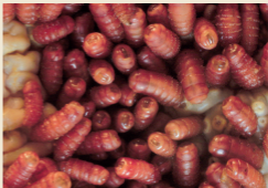
Gastérophiles larves L3